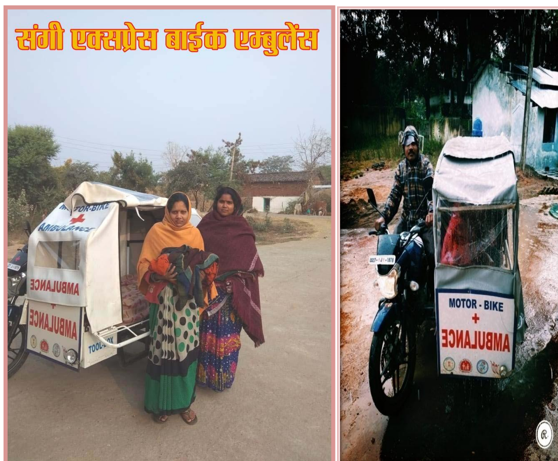
Fig.2 Motor bike Ambulance /SangiExpress

Five Motor bike ambulances specially engineered, pictured in Fig 2, specifically engineered for to act as a means of commutation in difficult to reach areas. The designing of motor bike ambulance / SangiExpress, includes comfortable sitting arrangement for minimum of five to six people to accommodate along with essential first aid tools and equipment. Similar motor bike ambulance services have been initiated in Sierra Leone and have shown positive response on its acceptability and accessibility in rural setup.